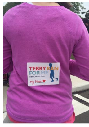
William Berczy PS (ZWillamBerczyPS - Sap 23 Thx to all for sharing your personal story -and celebrating live

Cross Country - 63 students from grades 3-8 have been waking up early to run in the mornings as part of this year's Cross Country Team. Congratulations to all athletes who competed Thursday, September 29<sup>th</sup> at the Area Meet! We are very proud of your accomplishments and of the many 'personal bests' that were achieved.